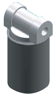
300MB w/50003 Adaptor